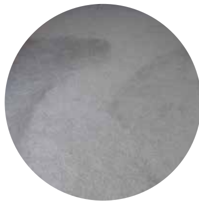
This is what a cut pile carpet can look like if shading occurs

Cut pile carpets, particularly plush pile carpets, may develop lighter or darker patches over time. Known as 'shading', 'puddling' or 'watermarking', it is caused by the permanent bending of the carpet pile fibres which then reflect the light differently. Brushing or shampooing does not reduce shading. The extent to which shading occurs cannot be accurately predicted or prevented. It does not affect the wear or durability of the carpet and is not recognised by Cavalier Bremworth as a manufacturing flaw or defect.